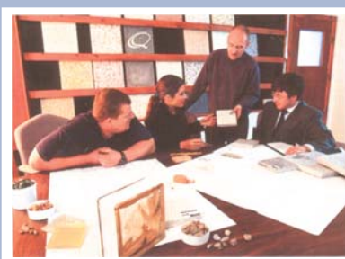
The Terrazzo Development Centre

Use Quiligotti's 'Terrazzo Development Centre' to create exciting and unique flooring solutions. Our highly professional design and technical facility is dedicated to providing bespoke flooring for all our Terrazzo specifiers.