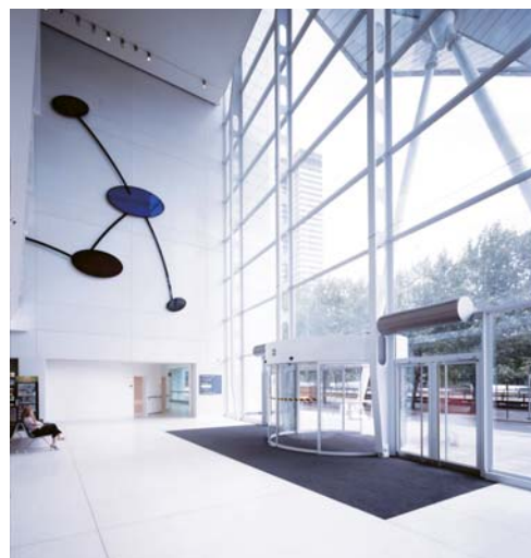
University College Hospital, London